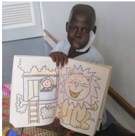
Patient receiving treatment for an aggressive facial tumour. To find out more go to Hope Stories

We are linked with a number of other organizations who have direct access to patients throughout Uganda who need specialist care.